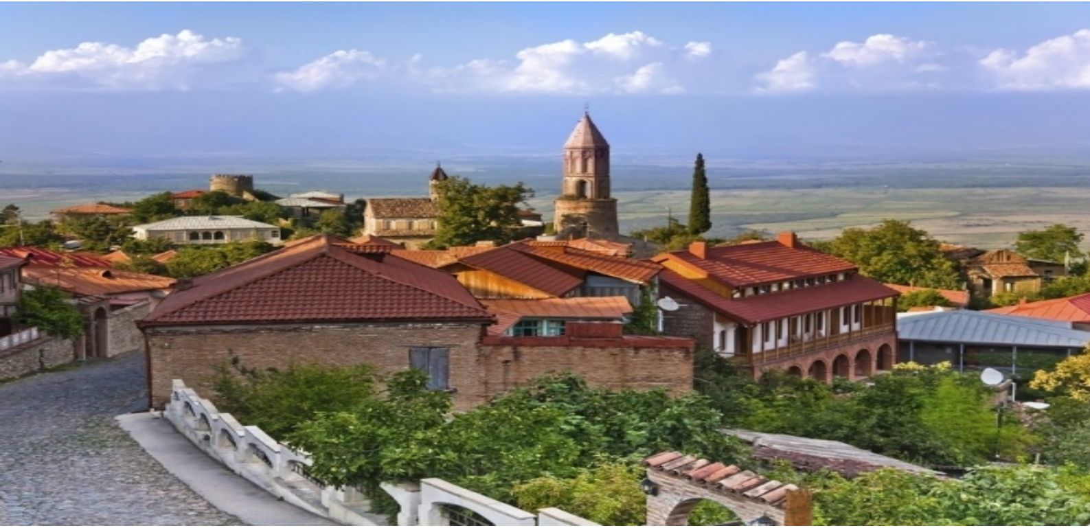
Enjoy lunch and Georgian Culinary Masterclass in Georgian winery.

In the evening, drive to Lagodekhi. Overnight at the local guesthouse.